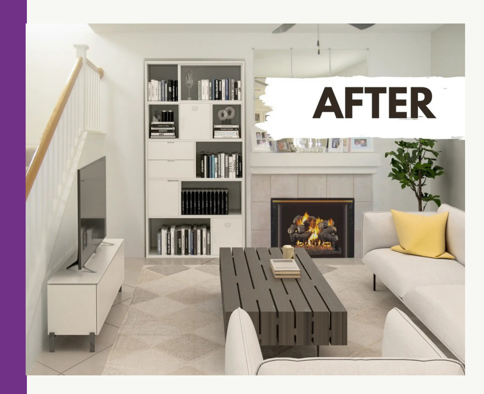
On-site Organizing & Staging: 7 Hours